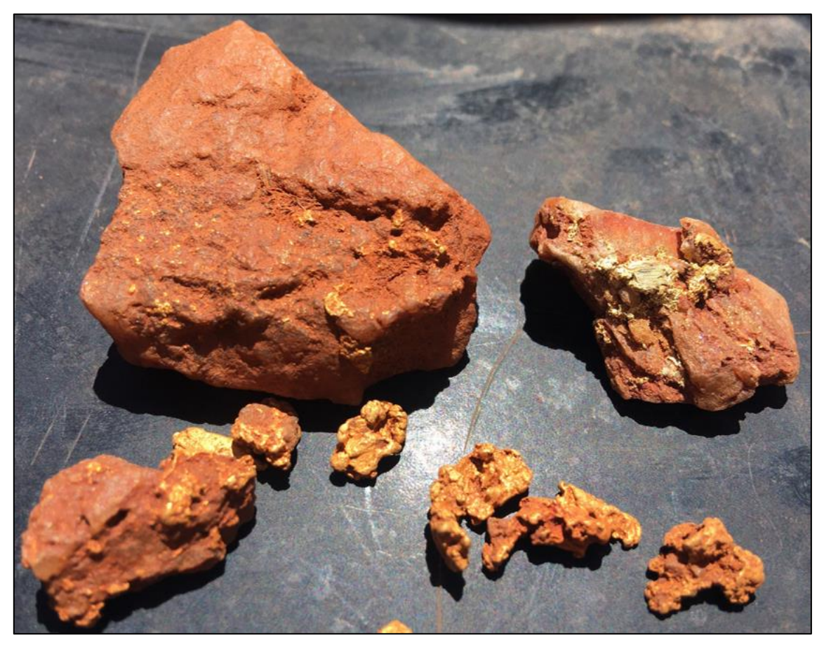
Figure 3 Examples of the gold* recovered in quartz from the 14UF015-Crossroads anomaly at North 1.

*Visual estimates of mineral abundance or analysis by pXRF should never be considered a proxy or substitute for laboratory analyses where concentrations or grades are the factor of principal economic interest. Visual estimates also potentially provide no information regarding impurities or deleterious physical properties relevant to valuations.