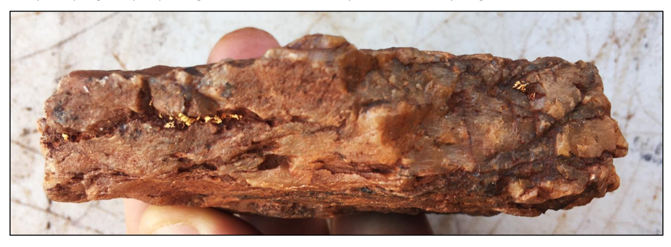
Figure 1 Gold* in specimen stone recovered from the North 1 target area.

The blocky angular nature of the specimen stone is interpreted as being close to the primary mineralisation. Ongoing rock chip sampling and prospecting will resolve this anomaly into a drill ready target".