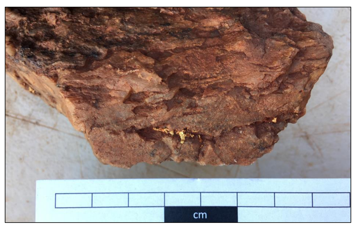
Figure 2 One of the gold* seams in specimen stone from North 1.