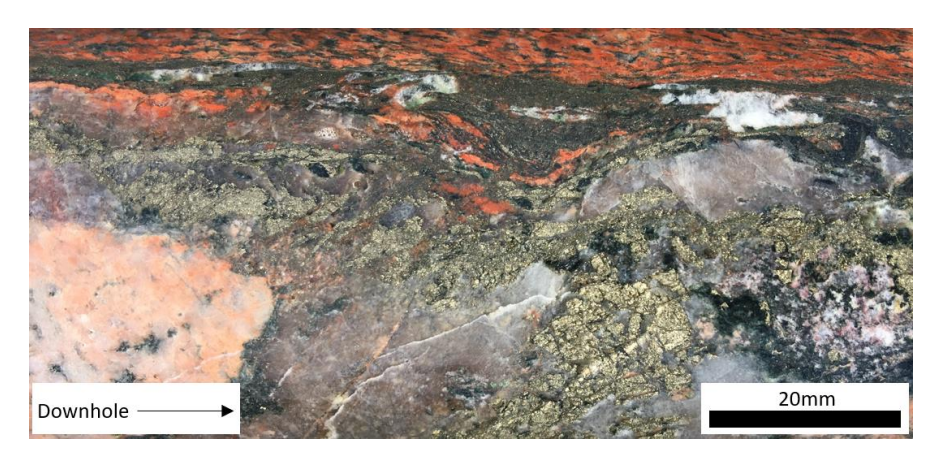
Figure 1: Alteration zone in FMDD0002 at 79m downhole; hematite altered granodiorite hosting quartz veining with tourmaline and pyrite; beneath historic hole KOW014, at Deep Well