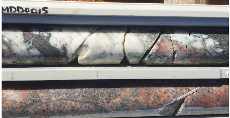
Figure 1: Strongly altered drill core at ~210m in FMDD0015.

<sup>1</sup>Refer to Independent Geologist Report in IPO prospectus dated 3 March 2021.