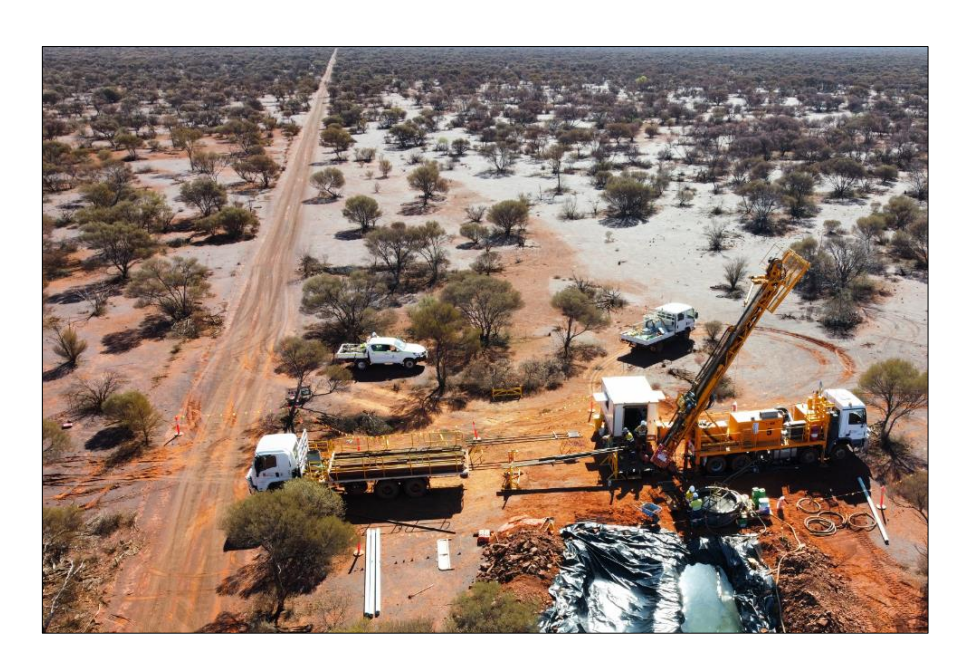
Figure 1: WDD Rig 5, on hole FMDD0001, at Deep Well

The Directors and Management of Iceni Gold would like to thank Westralian Diamond Drillers (WDD) for their significant efforts in mobilising drilling equipment and staff in a safe and efficient manner to commence the Compan'ys maiden drilling campaign at 14 Mile Well and we look forward to the next 2 years of exploration drilling success.