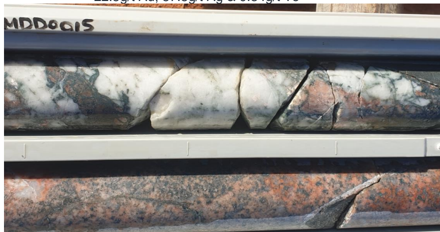
Figure 1: Strongly altered drill core at ~210m in FMDD0015.